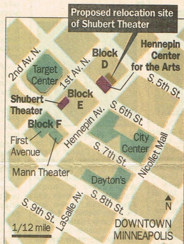
Star Tribune map

nonprofit arts developer that suggested the move, will present its studies on the costs of renovating and operating the Shubert, and on the initial reaction of the foundation community to paying for the renovation.